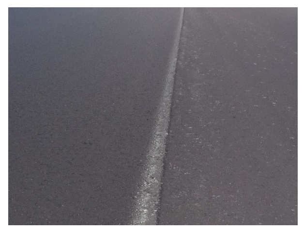
Figure 1.1-2 – Completed longitudinal joint with adhesive at Minnesota TH 100 during 2015 construction.