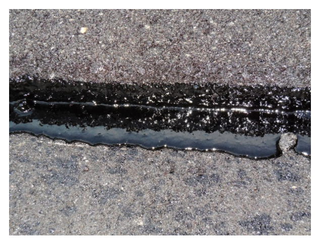
Figure 1.1-1 – Longitudinal joint with adhesive mastic at Minnesota TH 100 during 2015 construction.

Agencies typically require tack coat, or other adhesive, mastic, or sealant material, be applied along the face of a longitudinal joint prior to paving the adjacent pass. The intent is to enhance bond between the surfaces and improve moisture durability. It has been shown that good relative density along joints increases durability and there is no evidence that the application of tack coat or mastic is a replacement for good density relative to joint durability.